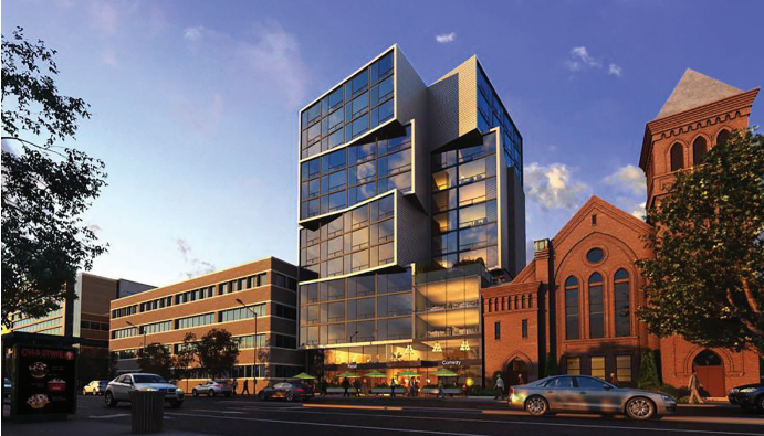
Veterans housing in Washington, DC

The HUD-Veterans Affairs Supportive Housing (HUD-VASH) program combines Housing Choice Voucher (HCV) rental assistance for homeless veterans with case management and clinical services provided by the Department of Veterans Affairs (VA). VA provides these services for participating veterans of all ages at VA medical centers (VAMCs) and community-based outreach clinics.