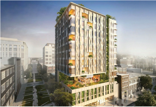
Multifamily housing in Portland, Oregon

Living in an apartment in a multifamily building immediately solves the most common problem of aging—steps. Almost all units are single-level.