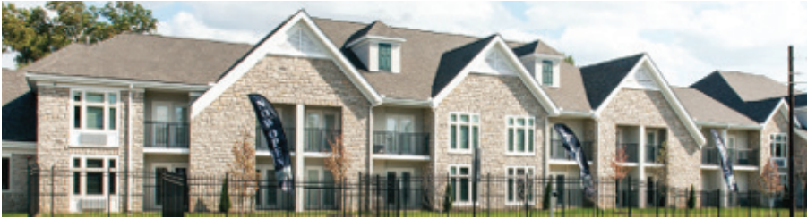
Assisted living in Columbus, OH

Assisted Living combines independence and some care. It is for those older adults who may not have debilitating health issues but need some help with Activities of Daily Living (ADLs). ADL is a phrase used within the care community that can include dressing, bathing, toileting, transferring in and out of bed, walking and eating.