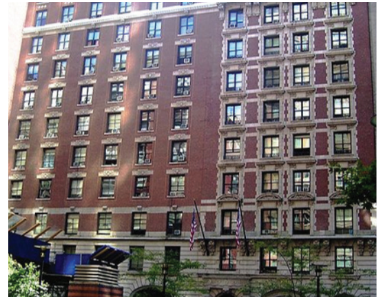
Special needs housing in New York, NY

The outcome of this effort has been impressive: residents spend 50 percent fewer days per year in psychiatric hospitals, make 58 percent fewer visits to emergency rooms, and are four times less likely to face medical issues.