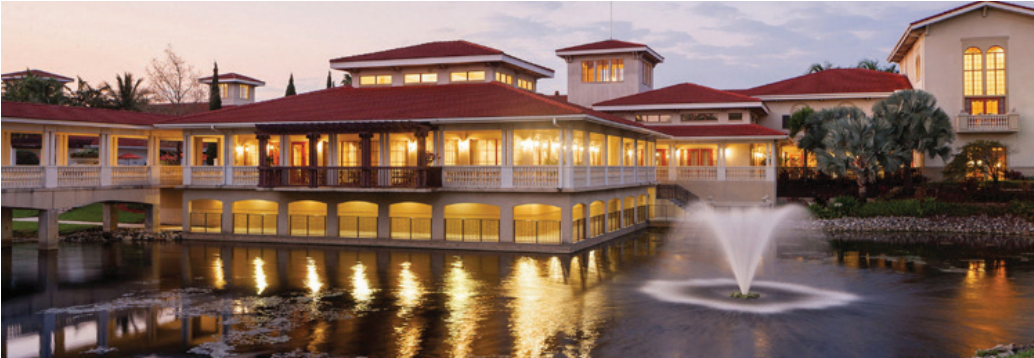
CCRC in Palm Beach Gardens, FL

CCRCs are the high end of senior living options both in services provided and costs.