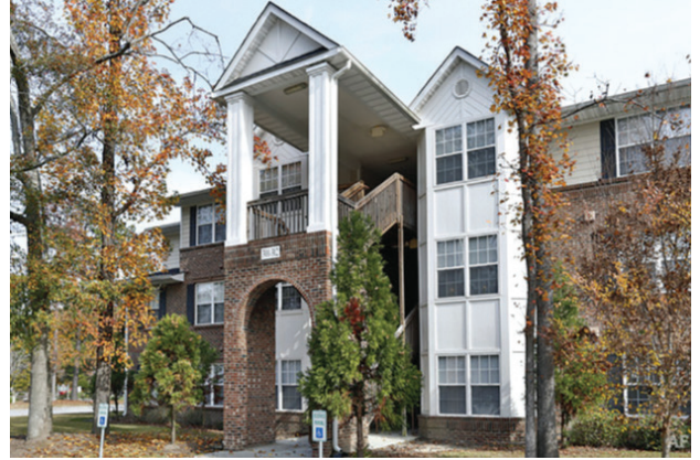
Senior rental housing in Charleston, SC

Management often acknowledges some residents will be living alone and tries to provide activities to combat loneliness. Some provide residents services that can include health assessments, access to in-home services from outside vendors and transportation. Some of the communities encourage residents to provide support for each other. As people age, many lose long-time friends who have either relocated (often to health-oriented facilities) or passed on. Adult children have work and family responsibilities and are not always able to put in the time they would like to share with their parents. Good senior housing management addresses these issues.